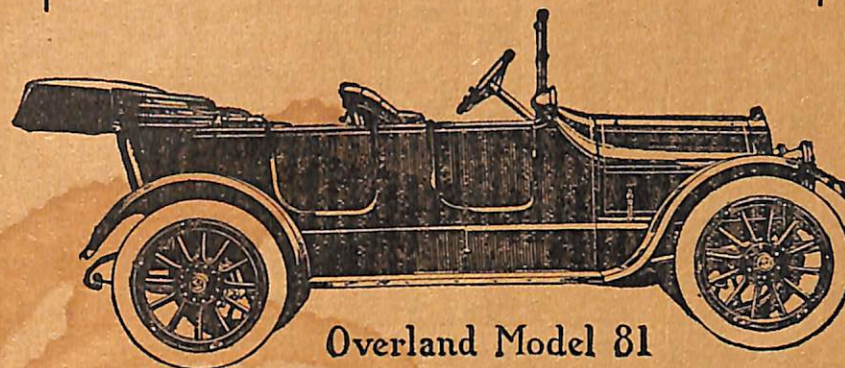
Overland Model 81